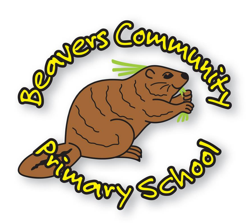
Respect - Determination - Cooperation - Equality - Honesty - Kindness